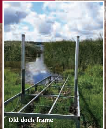
Old dock frame

The design, which was selected at the November meeting of the Crossroads Board of Directors, is a modular floating dock. Materials and installation will cost about $20,000. It is the Crossroads policy that for each major project, we now raise an additional 20% to fund a reserve account for on-going maintenance. Consequently, our fundraising goal for this project is $24,000. A gift of any size would help us reach our goal.